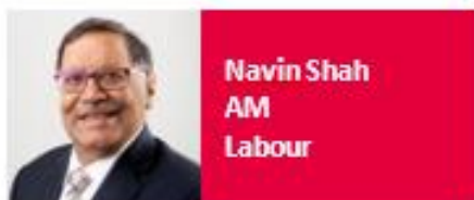
Navin Shah AM Labour