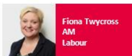
Fiona Twycross AM Labour

The Planning Committee's role is to scrutinise the detail of the London Plan, the Mayor's use of his planning powers and the strategic planning challenges facing London.